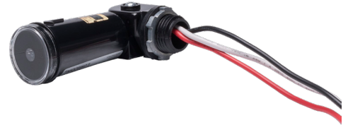
PHOTO ELECTRIC SWTCH INT MULTI-VOLT FIX- TURE MOUNT PEN