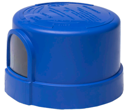
PHOTO ELECTRIC SWITCH MULTI VOLT TWIST LOCK